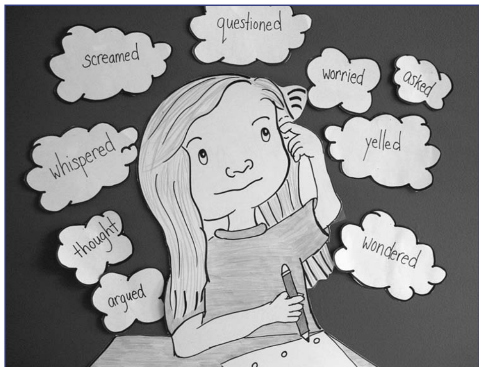
Use a word wall to help students discover alternatives to overused words. Add to or change the wall throughout the year